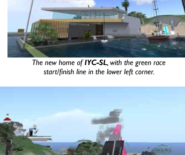
The new home of IYC-SL with the green race start/finish line in the lower left corner.