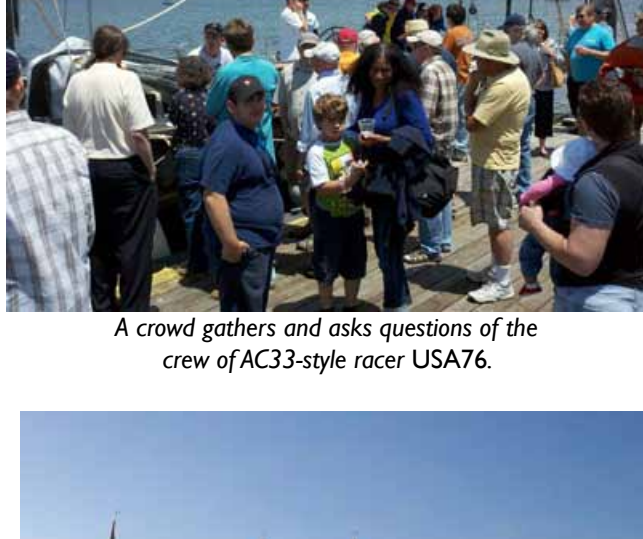
A crowd gathers and asks questions of the crew of AC33-style racer USA76.