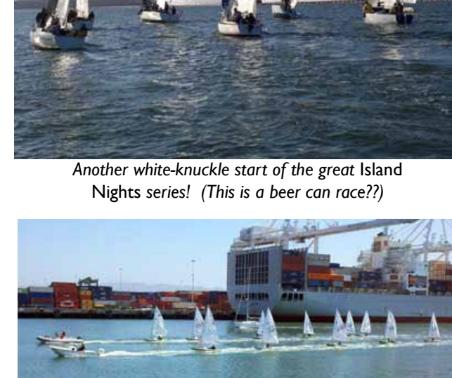
Another white-knuckle start of the Great Island Nights series! (This is a beer can race??)