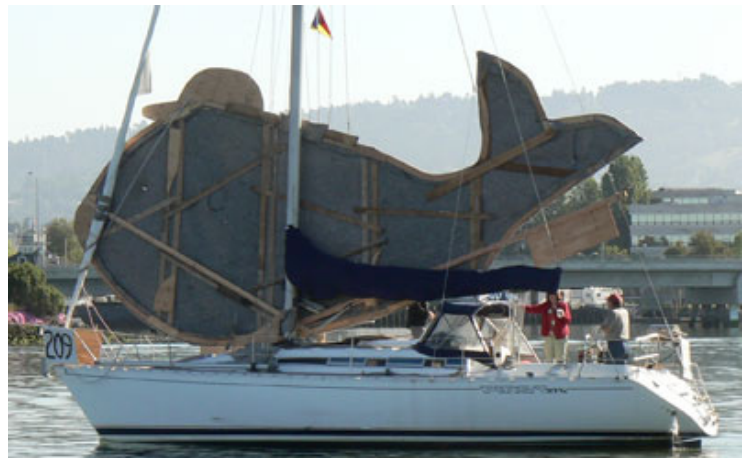
Sunday morning now, and Humphrey Returns does a photo lap out in the Estuary before heading to the staging area.