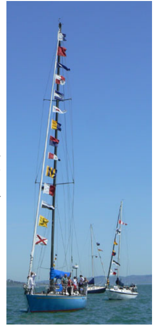
A couple of very pretty boats in the Flags and Streamers division.

The parade staging area is like a huge bumper-car race. Every boat is looking for the ones that will precede it (our number 209 had us looking for 204 (who never came) and 188), while trying not to run into every other boat that is doing the same dance.