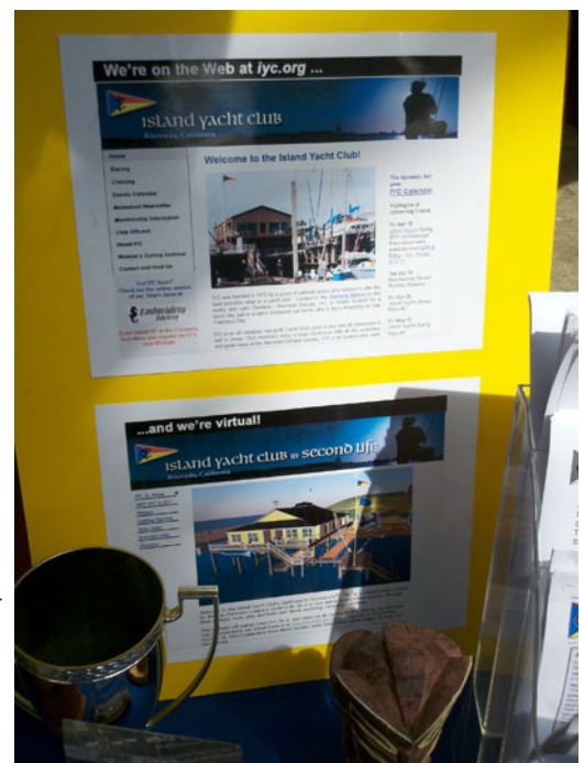
Information boards and some of our trophies graced our table (but the bowl of candy was probably the biggest draw)