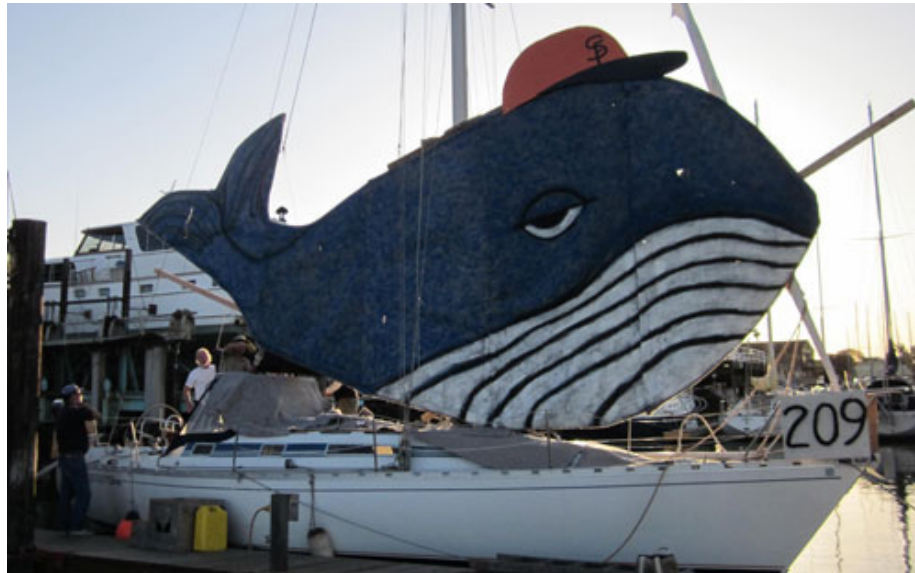
Whale Ahoy! Humphrey is up; just signage to be attached to the lifelines and we'll be good to go in the morning!