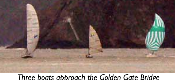
Three boats approach the Golden Gate Bridge at the end of a tough 25-mile race.