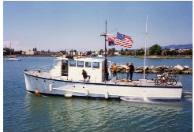
IYC sponsors the local Sea Scouts. This is their boat, the Sea Fox.

Please send your email to bmck1226@yahoo.com or call 415-265-6612 to confirm a reservation for either event. Advance payment by check sent to the Club or Pay Pal is always welcome. (Keep in mind that the March dinner is a week earlier