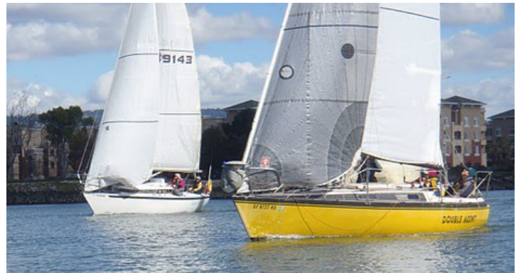
Double Agent and Solar Wind near Jack London Square