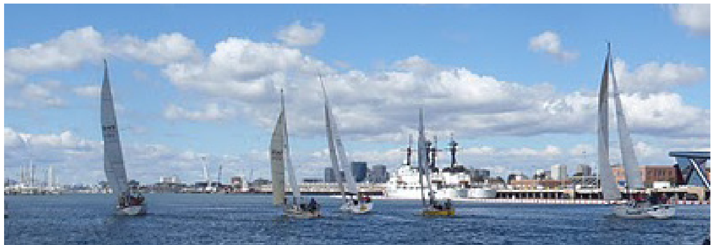
The race begins on what turned out to be a really pretty day. (Remember—it was supposed to SNOW that morning!)