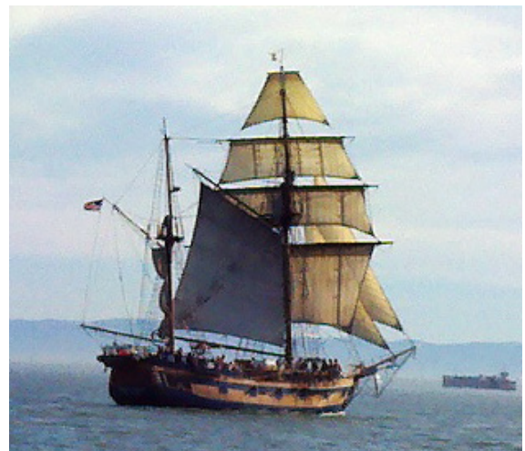
What a sight out on the Bay a few weekends ago! (Yes, we were actually sailing.)