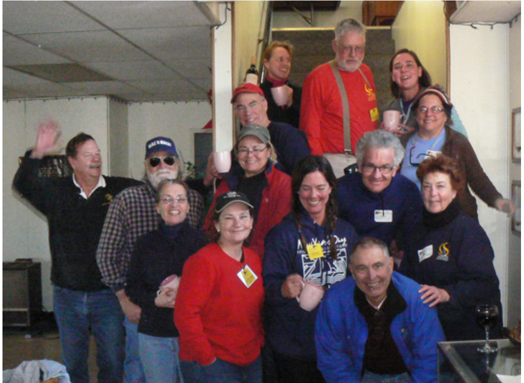
The Skippers and Boat Owners after this year's Sadie Hawkins Race