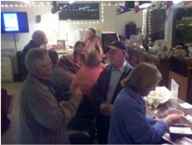
Gathering at the bar before dinner