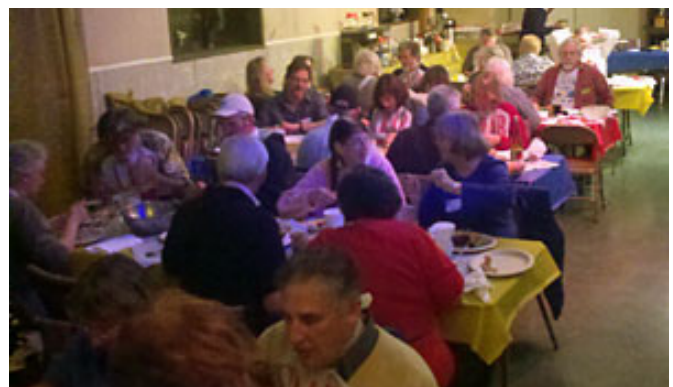
A packed dining room! (This is just the left half...)