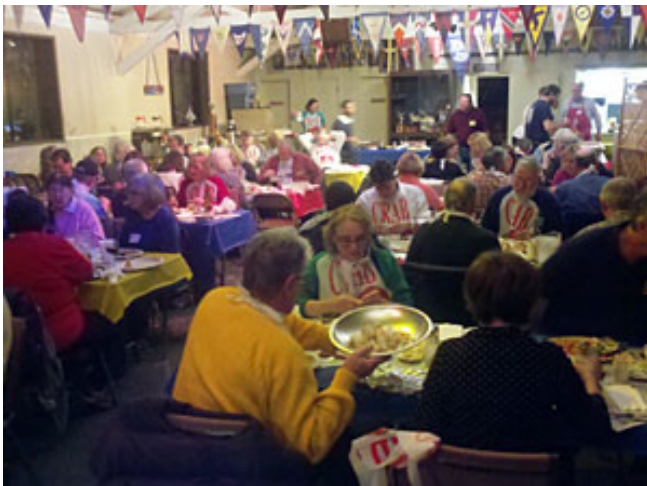
And then upstairs, where about sixty hungry sailors and guests enjoyed crab, pasta, salad and more!