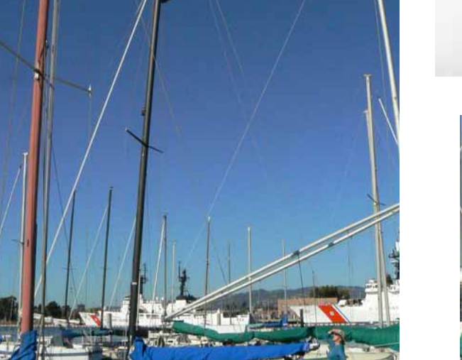
We usually see Wuvulu, Bewitched and Bodrum. Sunset out there competing with each other. But Saturday the three boats were out doing on-the-water classes for WSS students.