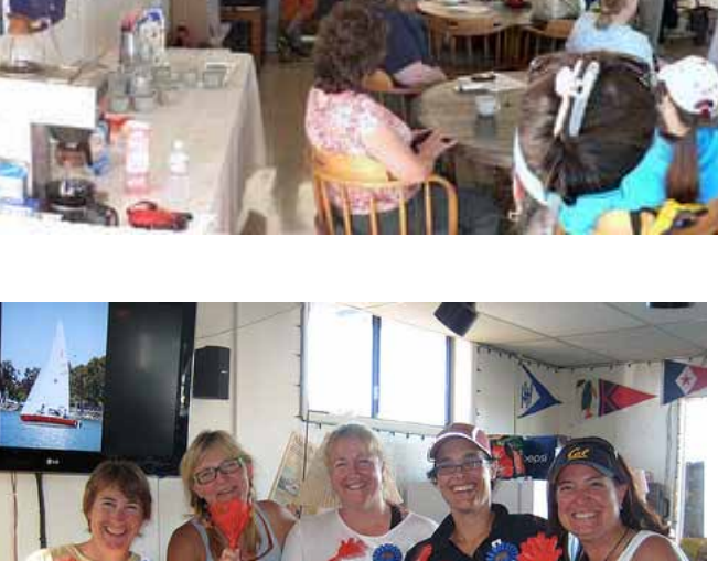
Blue Ribbons for First Place racers