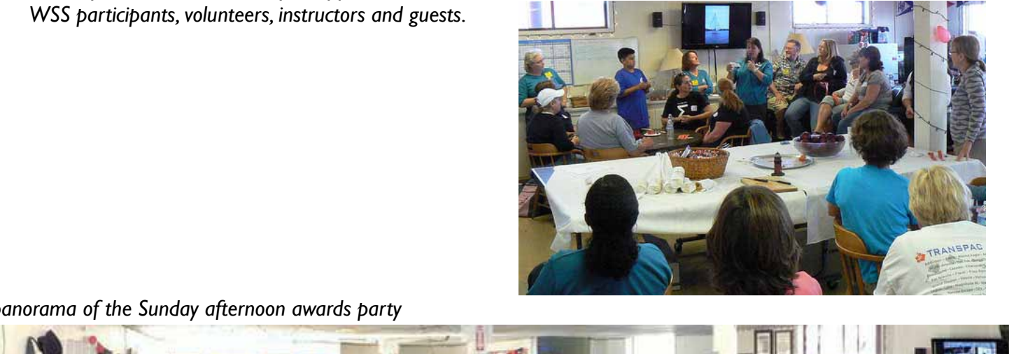
A panorama of the Sunday afternoon awards party